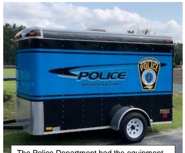
The Police Department had the equipment trailer wrapped to improve its appearance

For those that like to do child custody exchanges in the police department parking lot, this is the ideal spot to conduct those exchanges.